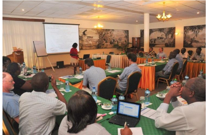
Joint workshop in Mombasa