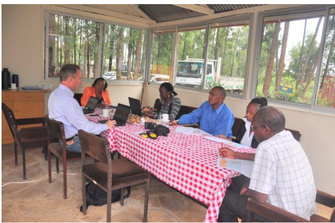
In-house assistance at Cimbria

Due to election we have decided to postpone some of the activities. We are hoping for a peaceful and fruitful election process, but still we do not want to run the risk of election in March interfering with our activities in Kenya.