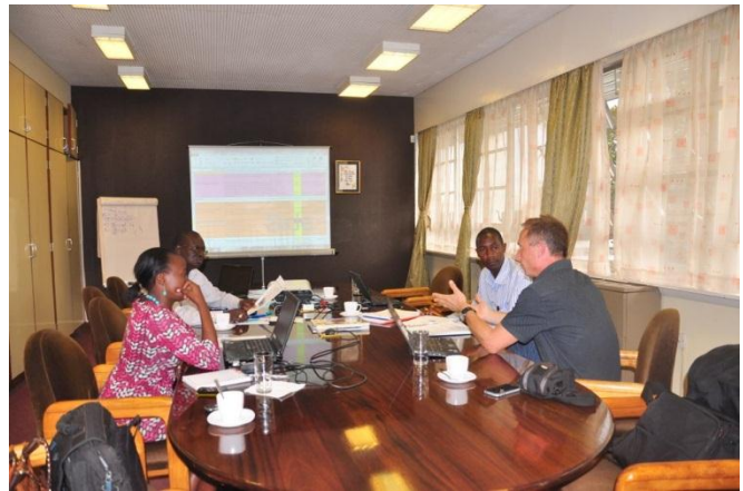
In-house assistance at HighChem

Just after the finalisation workshop in June, we will visit the Kenyan participants again in order to evaluate the results of the programme. Please make sure to update your documentation in terms of before/after photos and list of achievements including description of how your companies have benefitted – both with regard to CSR performance and business performance.