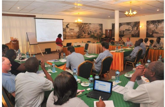
Joint workshop in Mombasa