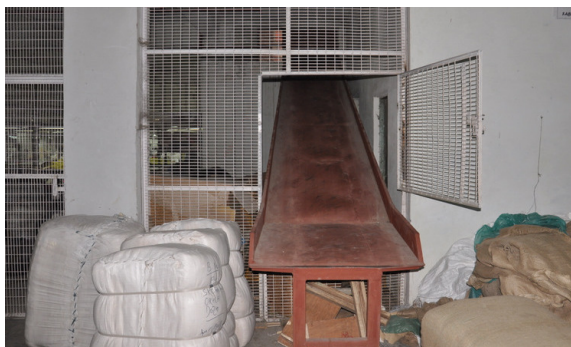
Slide used for easy transportation of heavy bags with fabric. One end of the slide is at street level where the bags are unloaded when they arrive at the factory, the other is in the cutting department where fabric is processed. At the old unit workers used to carry the heavy bags on their backs.

Merlin Creations has also made an arrangement with a local hospital to take care of workers in case any injury happens.