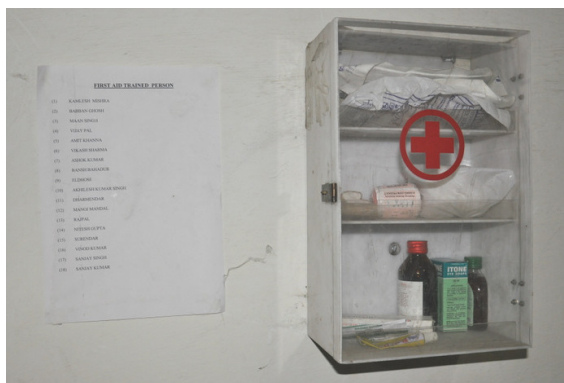
Sufficiently equipped first aid boxes have been provided and lists of first aid trained personnel are posted next to the boxes.

During the transition period of Merlin Creations to the new manufacturing site, proper health and safety measures as well as emergency procedures were implemented. The entire premise is covered with fire hydrants and adequate number of fire extinguishers have been installed. The company has also developed an emergency preparedness plan and an emergency exit plan has been displayed in strategic locations in each floor. An External agency has been appointed by the company to conduct periodic training on fire safety and for maintenance of fire fighting equipment. First aid boxes have also been installed and its content is systematically kept up to date and personnel have been trained in first aid techniques.