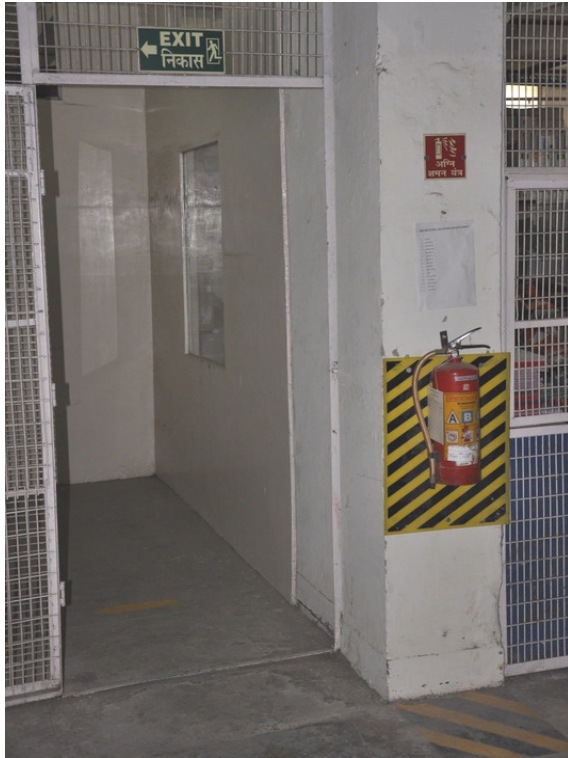
Emergency exits have been marked, fire extinguishers installed and area below fire extinguishers have been marked for keeping the area clear.

Merlin Creations has also made an arrangement with a local hospital to take care of workers in case any injury happens.