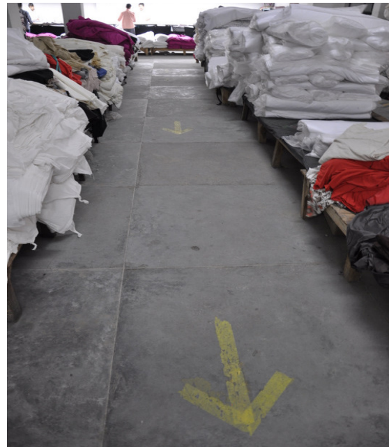
Emergency escape routes have been clearly marked for quick, safe and efficient evacuation in case of emergency.

In the new unit, a spot removal cabin has also been constructed with a local exhaust ventilation system so as to protect workers from exposure to harmful chemical substances.