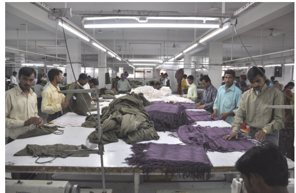
Energy friendly tube lights have been installed, saving 40% electricity. Overall illumination has improved compared to the old production unit. Also, space is now sufficient for a convenient working environment.

Merlin Creations has installed energy efficient tube light in the work area which saves around 40% of energy the required for illumination. The investment was rather large as normal tubes cost Rs. 200 per piece whereas energy saving tubes cost Rs. 1300 per piece. However, the workshop on cleaner production made the management aware of the long term savings which could be generated by this investment.